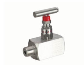
316/L; 1/4" NPT (M) x 1/4" NPT(F); 6000 psi; PTFE Packing