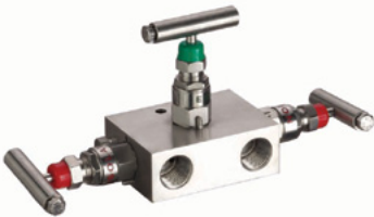
3 VALVE; Horizontal Style; Remote Mount; 316/L; 1/2" NPT (F) x 1/2" NPT (F) x 1/4" NPT Drain/Vent; 6000 psi; PTFE Packing