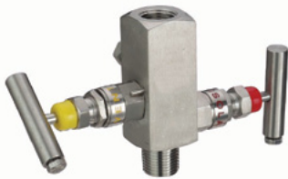
2 VALVE; B&B In-Line Style; Direct Mount; 316/L; 1/2" NPT (M) x 1/2" NPT (F) with 1/4 NPT (F) Drain & Plug; 6000 psi; PTFE Packing