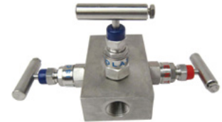
3 VALVE; Horizontal B&B Style; Remote Mount; 316/L; 1/2" NPT (F) x 1/2" NPT (F) with 1/2 NPT (F) Drain; 6000 psi; PTFE Packing