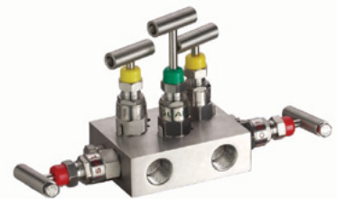
5 VALVE; Horizontal Style; Remote Mount; 316/L; 1/2" NPT (F) x 1/2" NPT (F) x 1/4" NPT Drain/Vent; 6000 psi; PTFE Packing