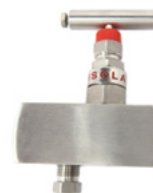
316/L; 1/2" NPT (F) x 1/2" NPT (F) with 1/4" (F) NPT Drain & Plug; 6000# psi; PTFE Packing