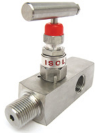
316/L; 1/2" NPT (M) x 3 - 1/2" NPT (F); 6000 psi; PTFE Packing 316/L ; 3/4" NPT (M) x 3 - 1/2"NPT (F) 6000 psi; PTFE Packing