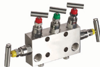
5 VALVE; Bar/ Wafer Style; Remote Mount; 316/L; 1/2" NPT (F) x 1/2" NPT (F) with 1/4 NPT Drain/Vent; 6000# psi; PTFE Packing 5 VALVE; Bar/ Wafer StyleType; Direct Mount; 316/L; 1/2" NPT (F) x FLG with 1/4 NPT Drain/Vent; 6000# psi; PTFE Packing