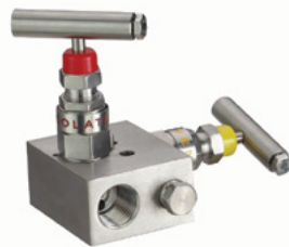
2 VALVE; Horizontal B&B Style; Remote Mount; 316/L; 1/2" NPT (F) x 1/2" NPT (F) with 1/4 NPT (F) Drain & Plug; 6000 psi; PTFE Packing