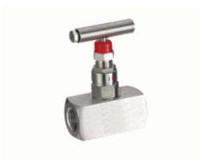
316/L; 1/4" NPT (F) x 1/4" NPT(F); 6000 psi; PTFE Packing 316/L; 1/2" NPT (F) x 1/2" NPT(F); 6000 psi; PTFE Packing