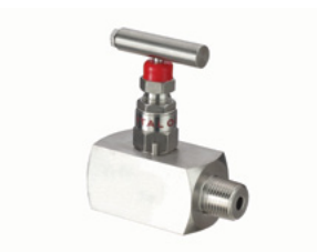
316/L; 1/2" NPT (F) x 1/2" NPT(M); PTFE Packing